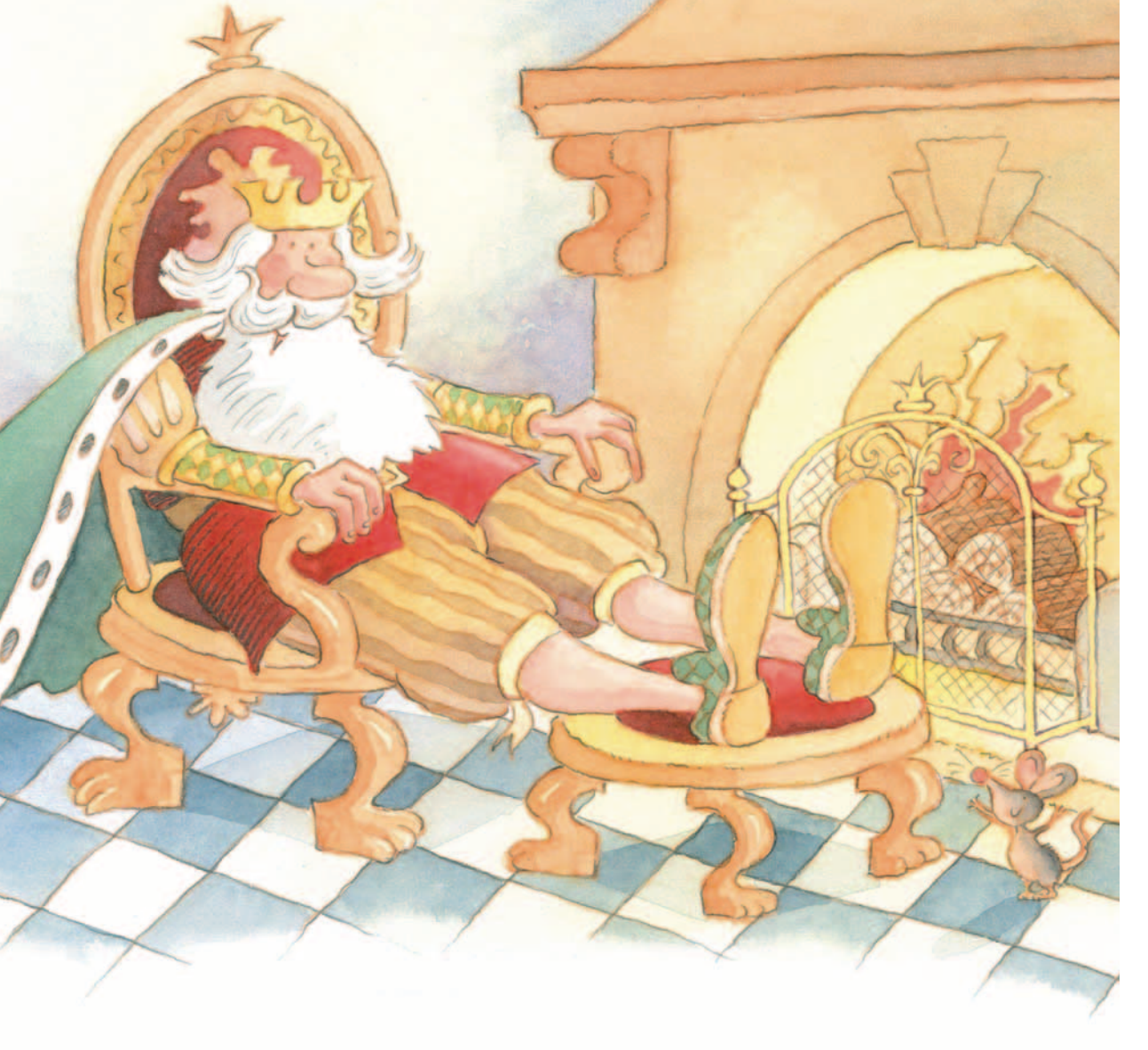
"I love my Royal Slippers," said the King.