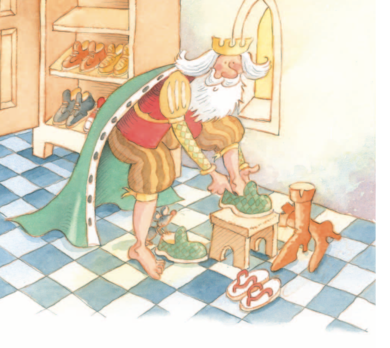
The King put on his Royal Slippers.