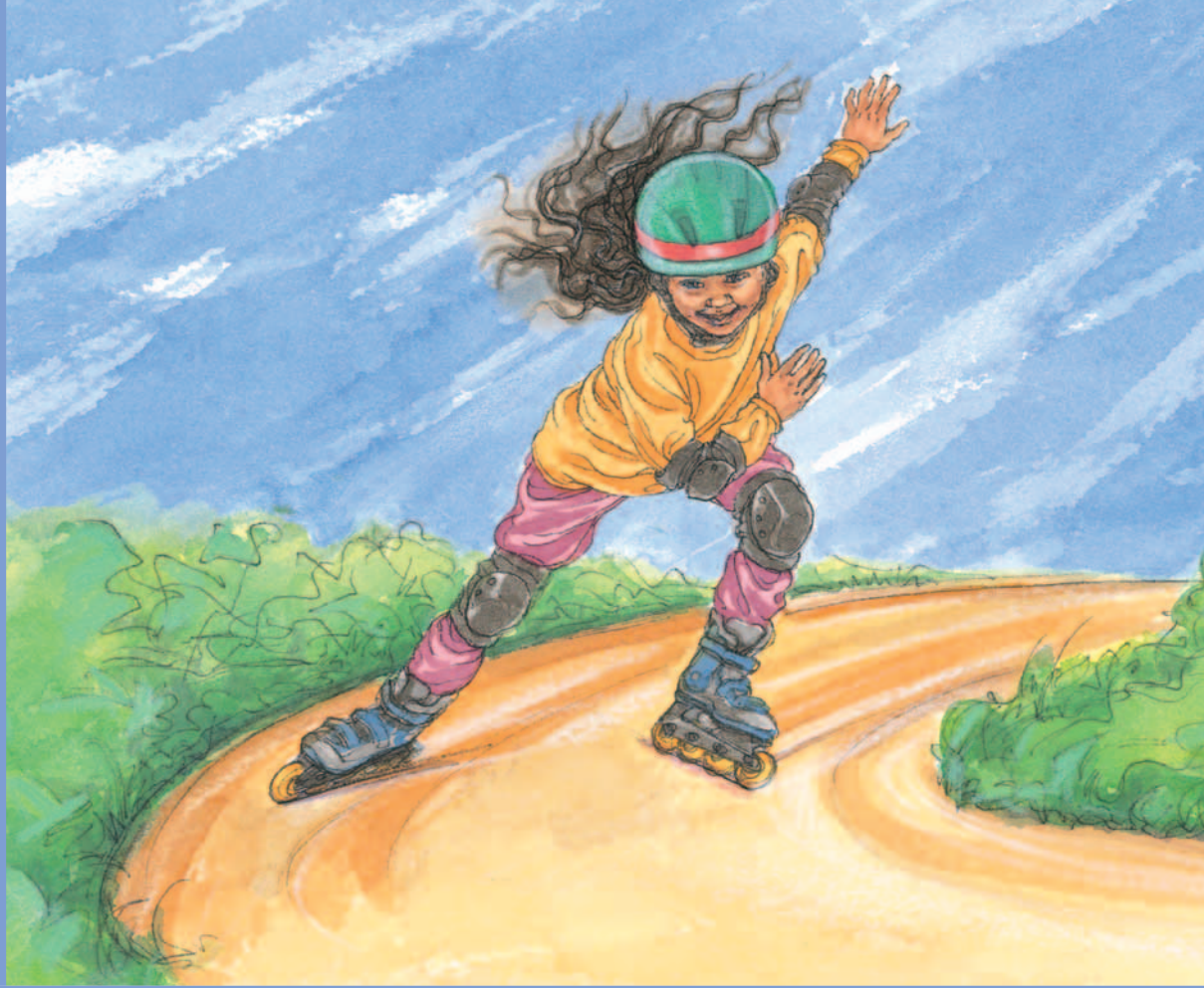
Vika went around the corner.