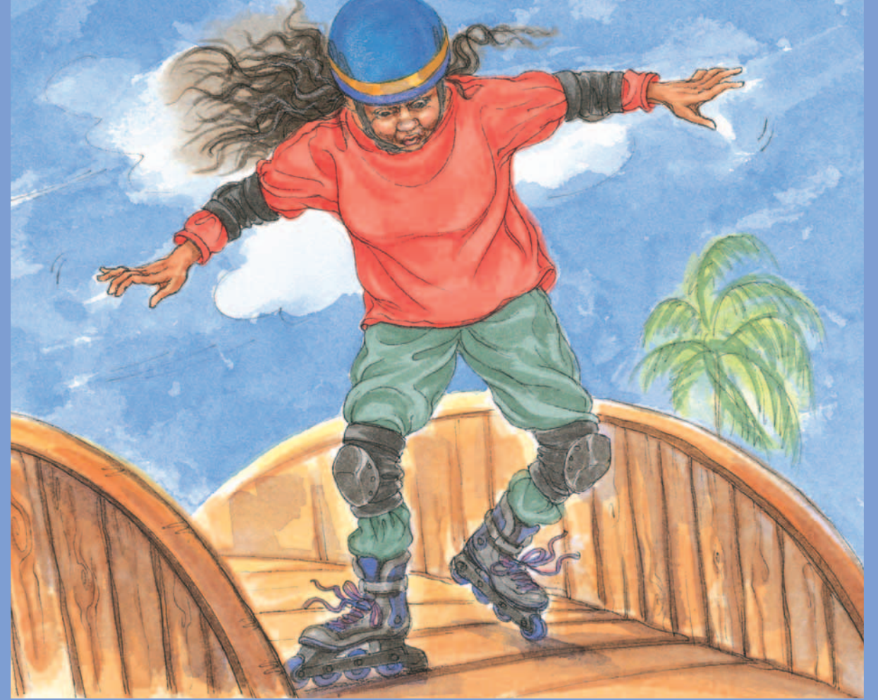
Mum went over the bridge.