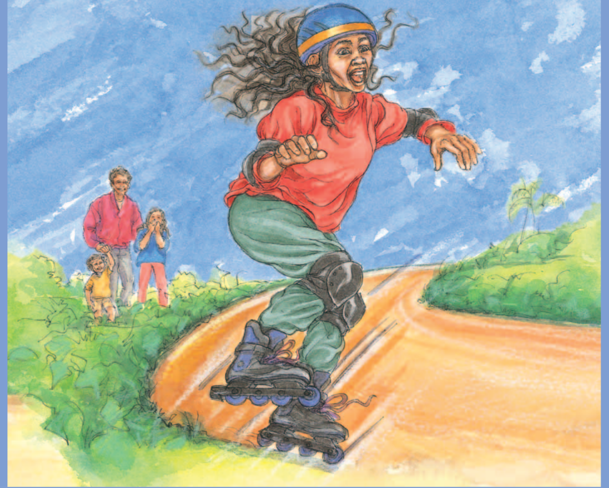
Mum went around the corner.