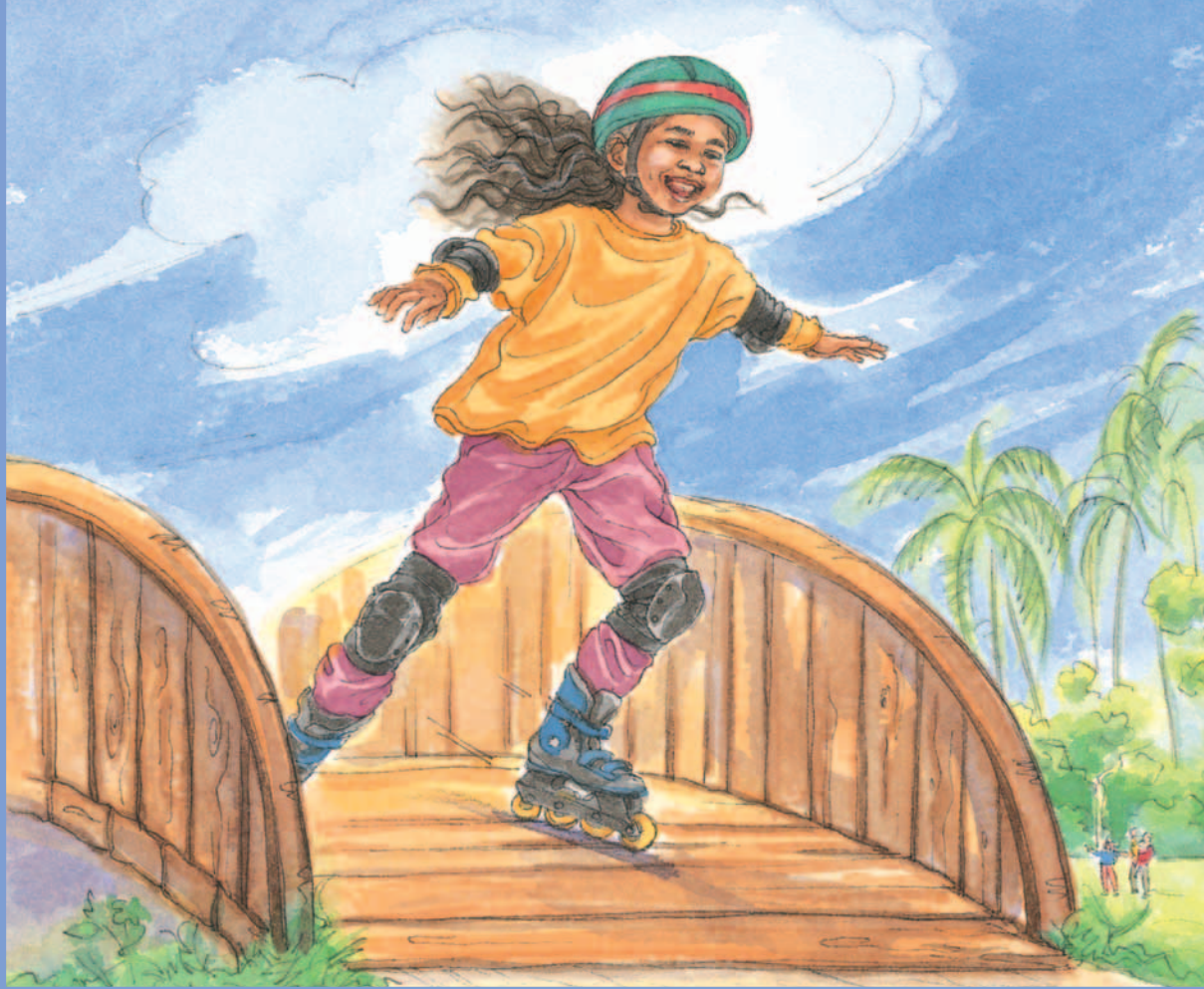
Vika went over the bridge.