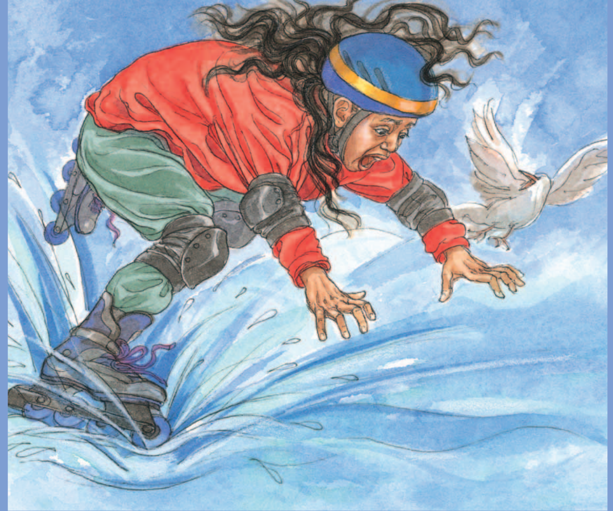
Mum went into the pond.