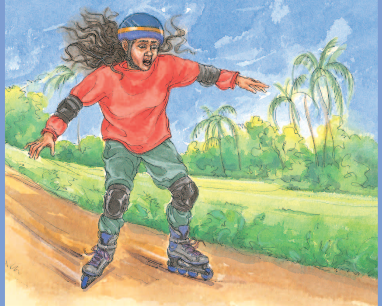
Mum went down the hill.