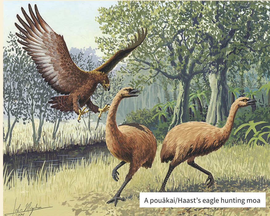
A pouākai/Haast's eagle hunting moa

palaeontologist: a person who studies fossils to learn the history of life on Earth