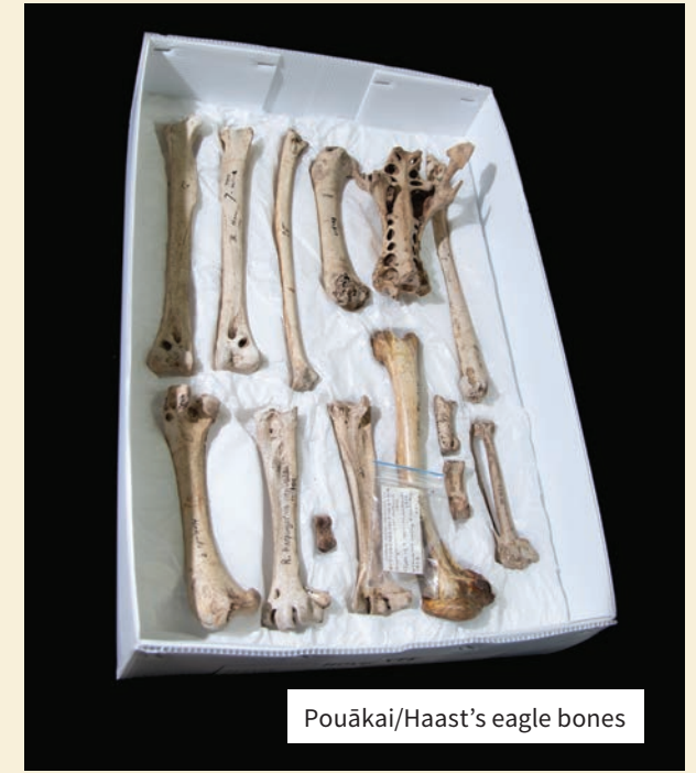
Pouākai/Haast's eagle bones