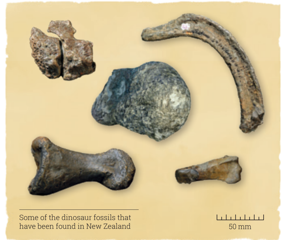
Some of the dinosaur fossils that have been found in New Zealand

Luckily, these fossil bones all have special features, so scientists can work out what kind of dinosaur each bone belongs to.